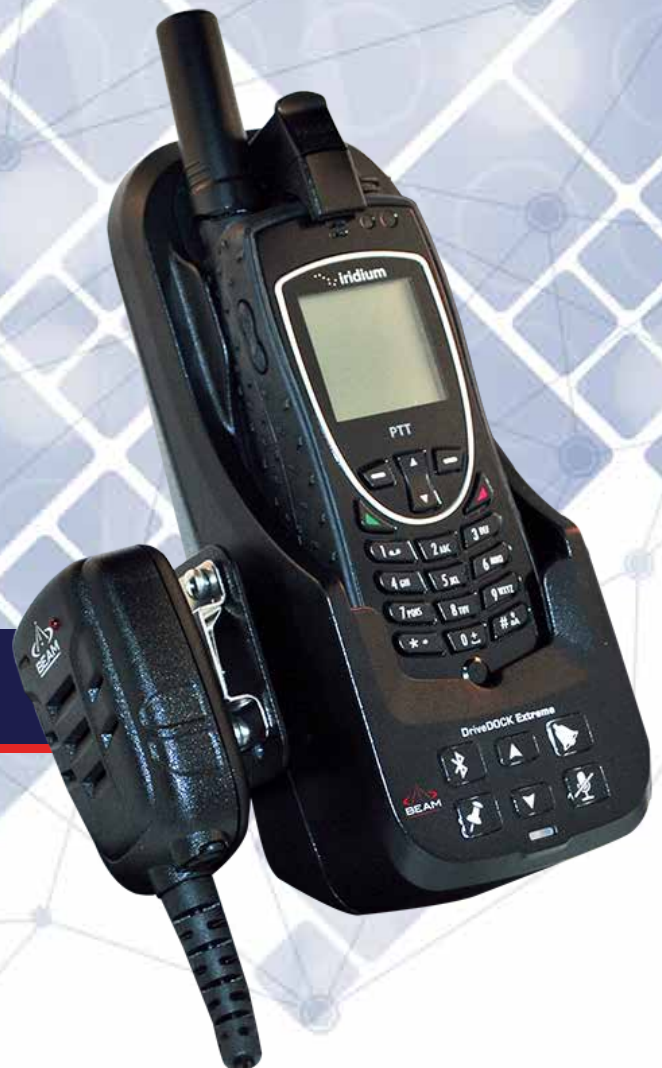
Corded Push-To-Talk Bundle