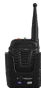
Secondary Wireless Handset (PTT100A)