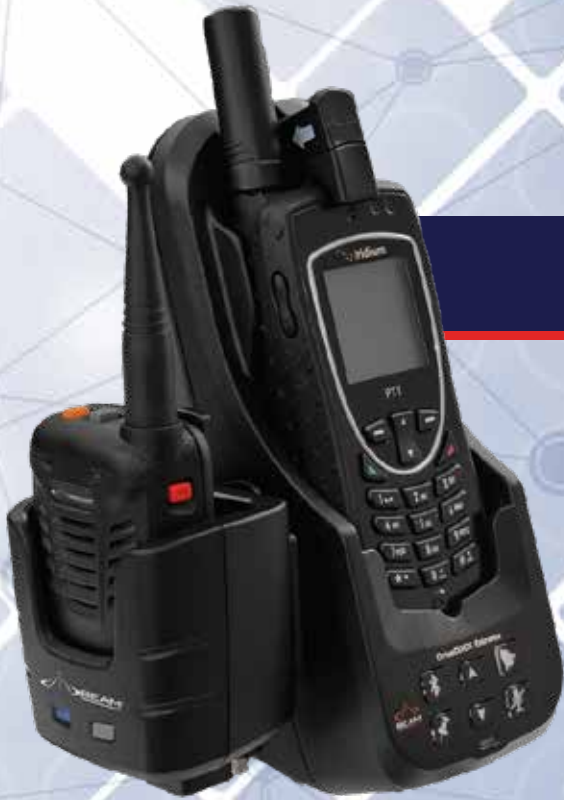
Wireless Push-To-Talk Bundle