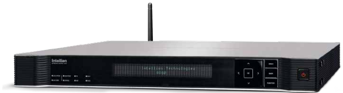
Below Deck Terminal (19" Rack Type 1U)